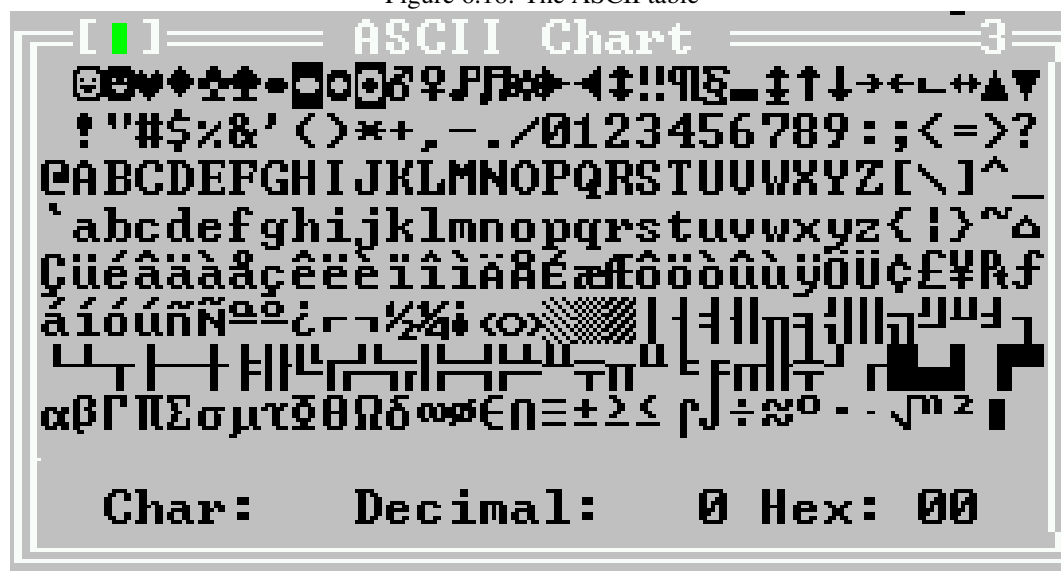
Figure 6.18: The ASCII table

The ASCII table remains active till another window is explicitly activated; thus multiple characters can be inserted at once. The ASCII table is shown in figure (6.18).